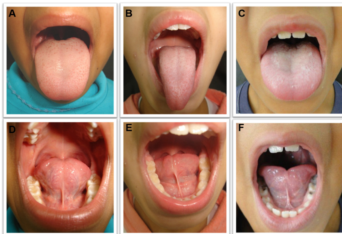
Figure 3. Characteristics of the tip of the tongue observed in 3 subjects diagnosed with ankyloglossia and their possibility of extending the tongue beyond the vermilion border of the lower lip, during protrusion. In A and D, tongue protrusion and elevation of subject 1; in B and E, tongue protrusion and elevation of subject 2; in C and F, tongue protrusion and elevation of subject 3.

Table 2 shows that most subjects with ankyloglossia (97.83%) can extend the tongue beyond the vermilion border of the lower lip during protrusion (Figure 3).