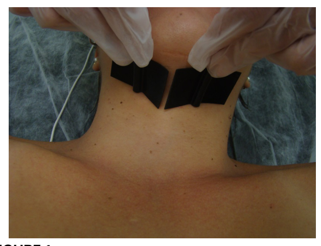
FIGURE 1. Surface electrodes on submandibular area during TENS stimulation.

The aim of this study highlights the need to develop further research with TENS and LMT in individuals with voice problems, and to develop more research on the effect of the application of both techniques in dysphonic individuals. The objective of this clinical, controlled, and prospective study was to verify the effect of TENS and LMT application and to compare the two techniques in relation to vocal and laryngeal symptoms,