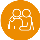
Occupational therapist (OT)