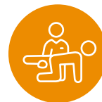
Physical therapist (PT)