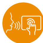
SLP with expertise in augmentative and alternative communication (AAC) from local university