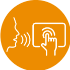
SLP with expertise in augmentative and alternative communication (AAC) from local university