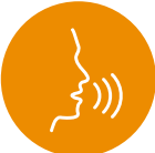
Speech-Language Pathologist (SLP)