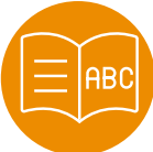
Early literacy specialist