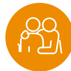
Occupational therapist (OT)