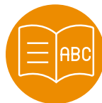
Early literacy specialist