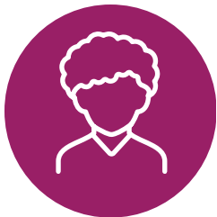
FINN 7½-YEAR OLD